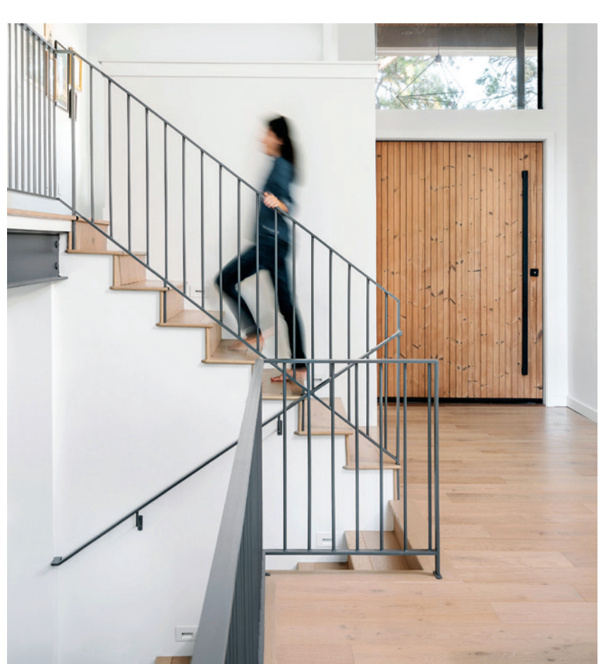
36 HOME DESIGN & DECOR AUSTIN-SAN ANTONIO | FEBRUARY / MARCH 2020

to-ceiling renovation that now serves as the heart of the home. Featuring a light wood palette that reinforces the home's Scandinavian style, Caesarstone® countertops, custom white oak cabinets with a wall of cabinetry splashed in Benjamin Moore®'s Knoxville Gray, floor-to-ceiling sliding doors and windows that connect to the backyard, the kitchen is a light-filled and functional space.